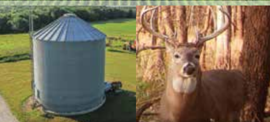
2,200 Bushel Grain Bin